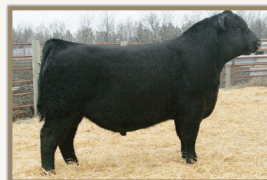
MAF DAKOTA WIND 545 - REG#: 18266604 Member of our Denver pen of 3 and is in the top 1% for $W, top 3% for WW & YW and top 5% for $F and scrotal. This bull has extremely impressive growth numbers and hasn't slowed down a bit since weaning and yet maintains a moderate birth & CED package.