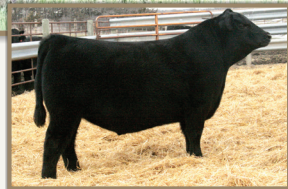
MAF TANKER 5501 - Reg#: 18251133 Part of our pen of 3 we took to Denver for the National Western Stock Show. Like his sire, he's in the top 1% of the breed for WW, YW, $W & $F and is in top 3% for calving ease (+14 CED)