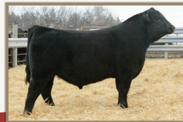
MAF DAKOTA MINT 532 - REG#: 18266605 Member of our Denver pen of 3 and is in the top 2% for WW & YW along with the top 3% for $W & $F. Has been a stand out since birth and impresses all those who see him in person.