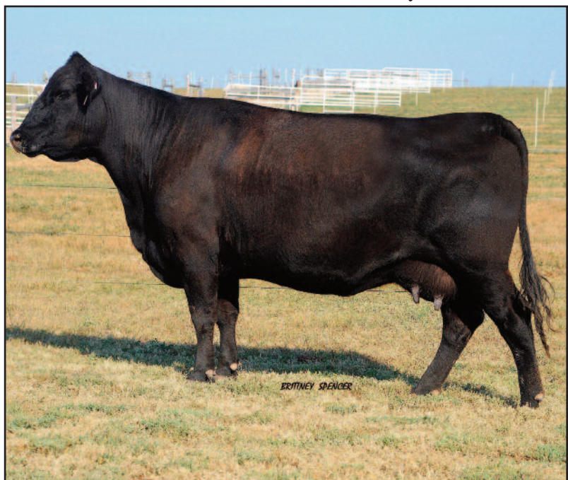
Dam of lots 27, 32-37 & 64