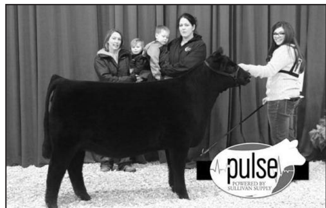
Champion Angus heifer and 5th overall at the Kansas Beef Expo and full sibling to lot 26.