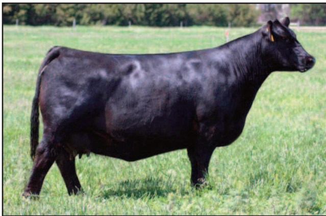
Dam of lots 26, 70 & 71