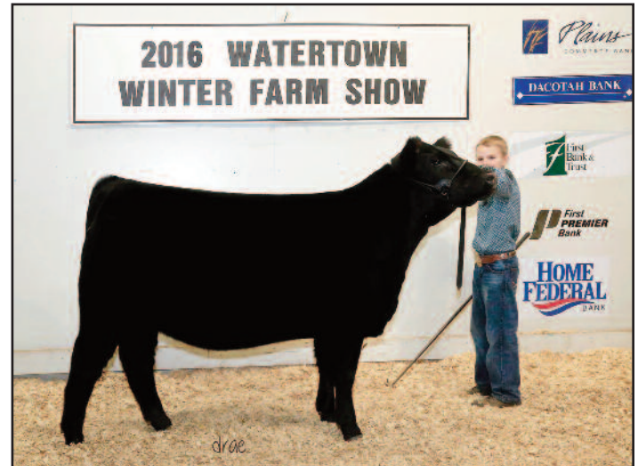
Full sibling to lot 26 ... Congrats to the Bergh family!