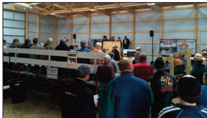
Scene from last year's sale!