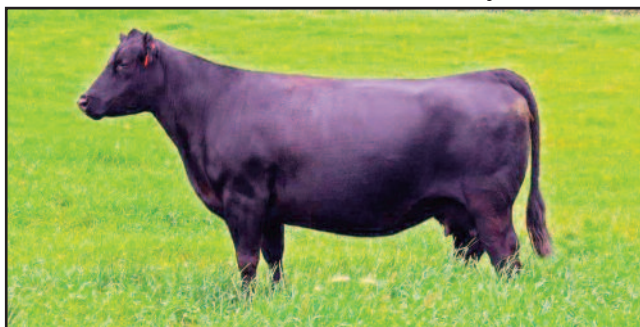
Dam of lots 28, 29, 30, 31 & 75