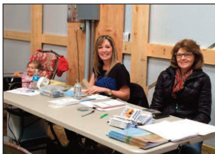
Scene from last year's sale!