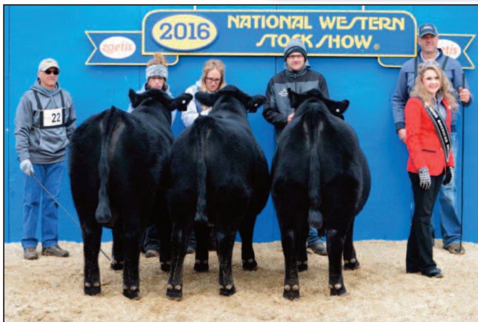
National Western Stock Show at Denver Reserve Late Calf Champion Pen of 3