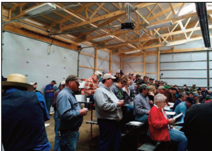
Scene from last year's sale!