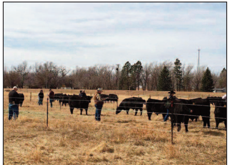
Scenes from last year's sale!

Sold for $27,000 to Full Day Enterprises and is a full sibling to lots 70 & 71